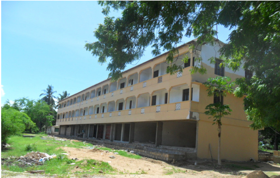
The new addition – The newly constructed residential quarters for our Ustadhs